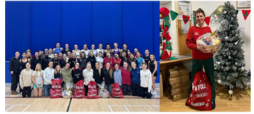
UWE NETBALL CHRISTMAS BASKETS FOR CHARITY

The netball club have ended the semester by spreading some Christmas joy! The club have worked together to create some Christmas hampers for local hospitals! The club's Christmas hampers went to Paulton Memorial Hospital rehab inpatient ward, Southmead hospital Ward 8A gastro and endocrine and Southmead hospital ward 34a+b neuro and stroke ward, along with the Bristol Childrens Hospital on behalf of the Grand Appeal Charity!