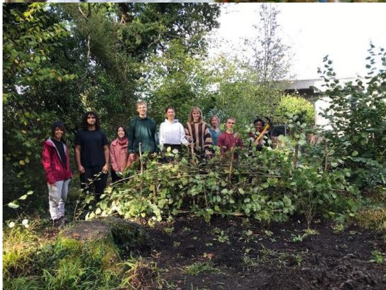
Students and their newly created living fence at Splatts Abbey Wood during a Greenspace session in October.