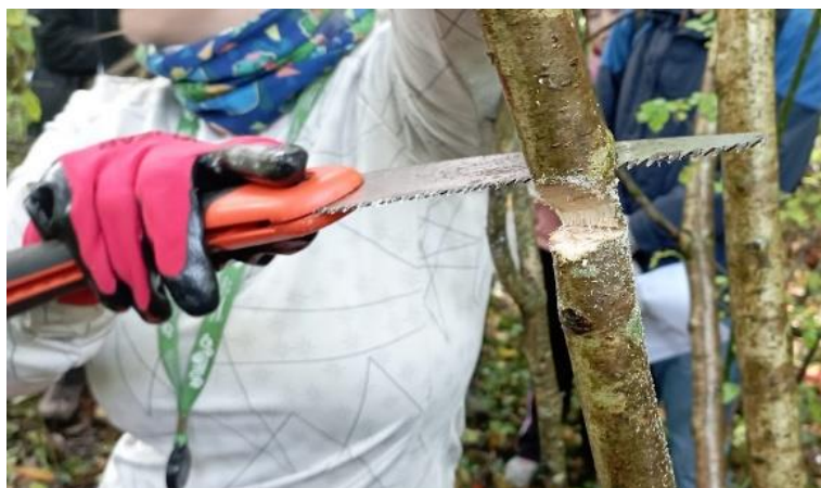
Students learning woodland management skills as part of the Greenspace sessions

We have successfully recruited eight student Project Leaders who help local woodland committee members run the Greenspace sessions which are usually once a month on a Saturday. The project leaders keep tools in the community garden shed, and last week they cleared out and organised the whole shed. A conservation student is also doing a placement with Greenspace as well for his 60 hours of volunteering needed for his course.